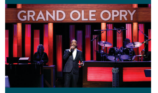
An Opry Salute to Ray Charles THU September 12 | 10 PM

Big Family: The Story of Bluegrass Music THU September 12 | 8 PM