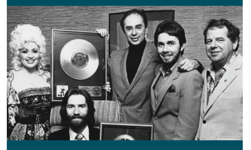
Music Row: Nashville's Most Famous Neighborhood THU September 26 | 10 PM

ON-AIR | MOBILE | ONLINE | CLASSROOMS | COMMUNITY