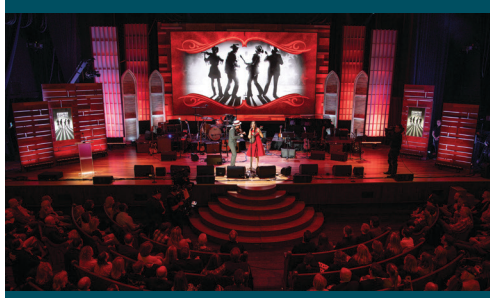
Country Music: LIVE at the Ryman SUN September 8 | 8 PM